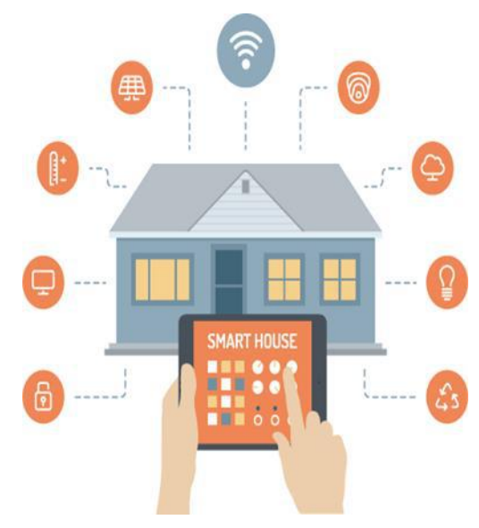
Fig.1: Smart house.

It is necessary to acquire all the statistics used previously in the implementation of the same project or even a similar project. As this is a product-based project, there is no need for a deep theoretical and practical evaluation, however the product-based project requires a detailed knowledge of the various procedures. As we talked about various control mechanisms through home automation based on Android, showing the number of procedures used to handle home utilities.